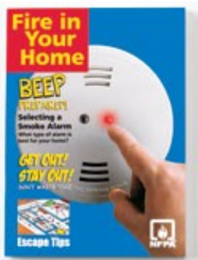
FIRE IN YOUR HOME 2010