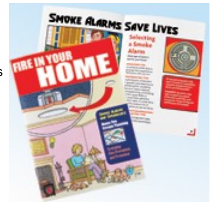
FIRE IN YOUR HOME 2011

For those that do not have school age kids but would like a copy of this valuable tool or any other Fire Prevention information please stop by the fire station and one can be provided to you.